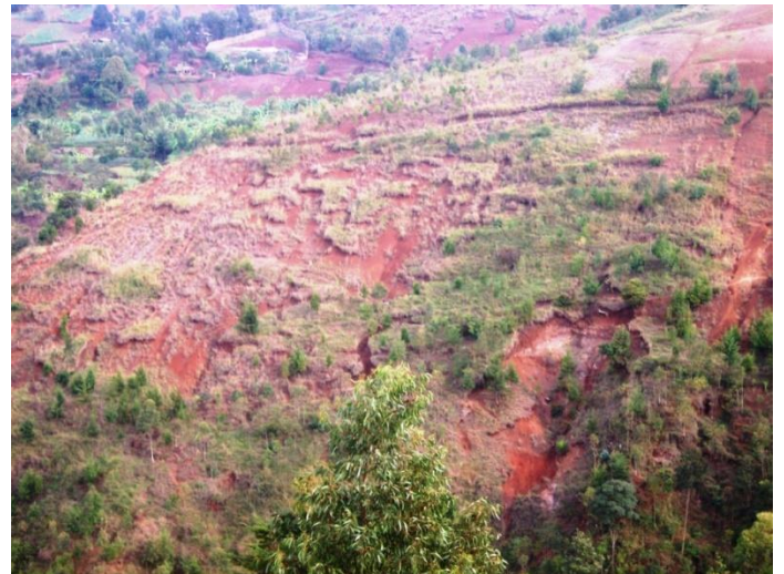
Eroded sloping land at Bushushu

In the absence of any external intervention, Landcare has developed within the community and is a core feature of Patrick's GERI.