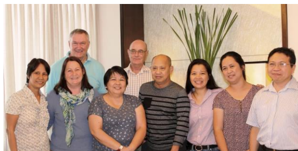
The ACIAR Mindanao Project team

The five-year project is funded by the Australian Government through the Australian Centre for International Agricultural Research (ACIAR). It aims to develop a new agricultural extension framework that can be used by communities and agencies in conflict zones.