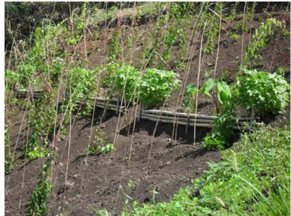
Ineffective erosion control bamboo barriers

soils, land use, land capability, weather) in order to assess the vulnerability of the catchment to climate change. Extensive information gathering of the socio-economical factors (village population, schools, household income and expenditure, attitudes to change, etc) also provides a good base for planning future programs.