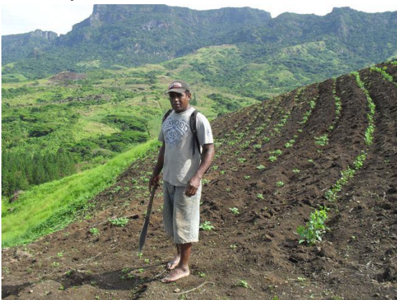
Steep slopes in the Sabeto catchment , Fiji.

SPC have a program to improve the land management of the Sabeto catchment near Nadi in western Fiji. The catchment has significant commercial fruit and vegetable growing on its lower lands which were severely affected by flooding and soil loss following serious storms in recent years.