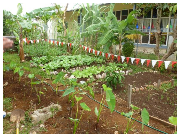
Productive Popua food gardens

Last year we told you of the first Landcare group in Tonga – the village of Popua - which is beset by poor land and exposure to storm surges and flooding due to its low lying spot near the capital Nuku'alofa. Following a successful food garden and conservation project funded by Rotary Australia, under the guidance of ALI member Bob Edgar, Popua opted to take on the Landcare mantle. The Crawford Fund supported further training and evaluation at the village in June 2014.