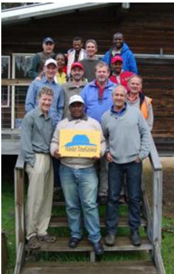
Participants and supporters of the first African Master TreeGrower course

We have seen the successful application of Australia's Landcare model in Australia and developing countries, and the Crawford Fund has supported Landcare training over the years, most recently in Africa. Now, a group of Australians are looking at applying linked Australian idea to suit the needs, aspirations and opportunities facing farmers and foresters across Africa with Master Tree growing training.