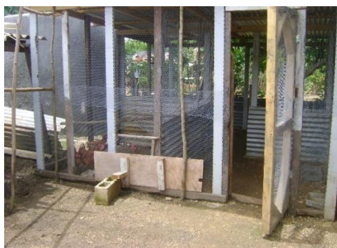
Poultry shelter in Popua Village

The initial stage of the project in Popua village is coming to a close. This project has been funded through Foundation of Rotary International. As part of the project a number of residents have built shelters to protect the young chickens from predation by cats and dogs. The shelters have been built using steel and mesh bought using grant funds and supplement by local materials. Shelters are stocked with local chickens and it is planned to introduce improved meat genetics provided through a United Nations program.