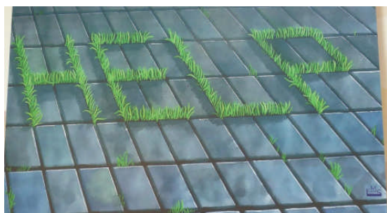
UNCCD Cartoon. :

New Zealand Landcare Trust www.landcare.org.nz/