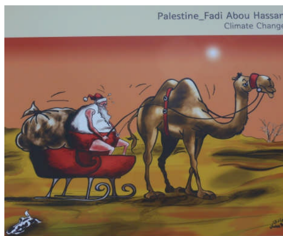
UNCCD Cartoon. :

Landcare International has called for a UN Declaration for an International Year of Landcare (IYL). Landcare International and ALI have pledged to promote the notion of an ILY where ever possible. The UN process is long and complex, with many more stages. But we are hopeful the IYL will eventuate